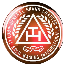
General Grand High Priest